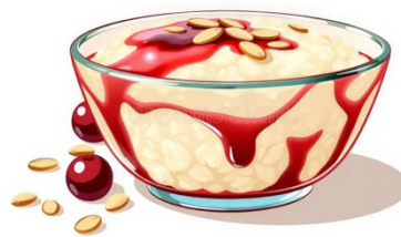
risalamande (udtales risalamang)